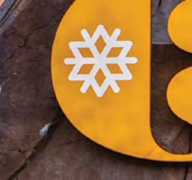
EXHIBIT & CONFERENCE SUPPORT INFORMATION